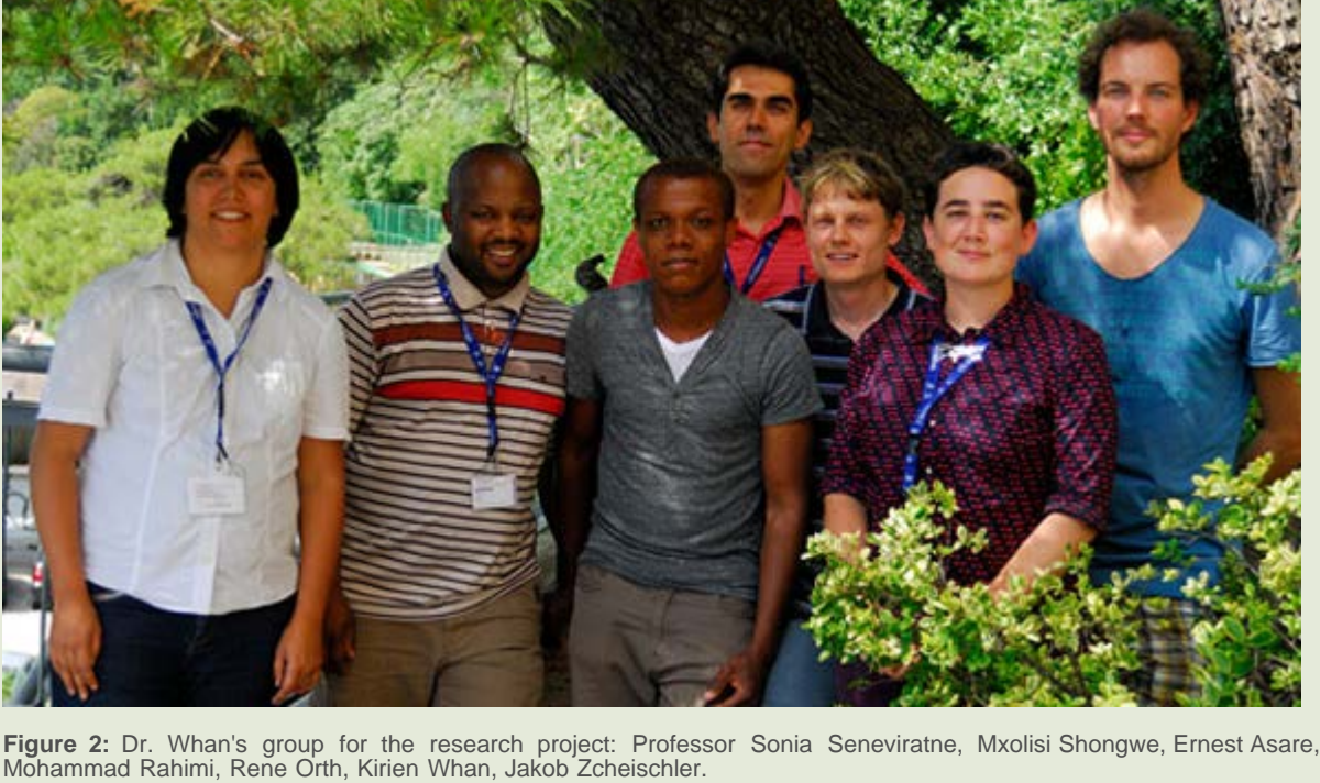
I was recently lucky enough to attend the World Climate Research Program (WCRP)-International Center for Theoretical Physics (ITCP) Summer School on Climate Extremes in

Trieste Italy. Extreme climate events have a large impact on both the environment and society.